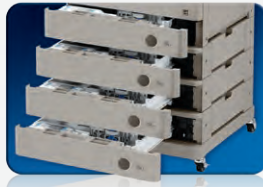
One-button Paper Access