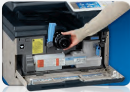
Easy Toner Access